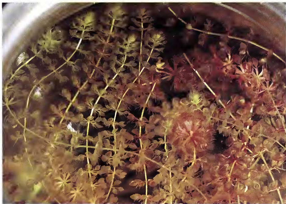
Figure 2: Aldrovanda vesiculosa from southeast Australia in a 3-liter aquarium, October 1998.